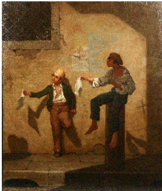
Fig. 6. Roman Newsboys II , Martin Johnson Heade, oil on canvas, 28 x 24 in. (c. 1849). Private collection.

Martin Johnson Heade returned to America from a visit to Rome, where excited by the progress of the events, he chose to paint a political picture that was relevant to its times. But in 1849, the