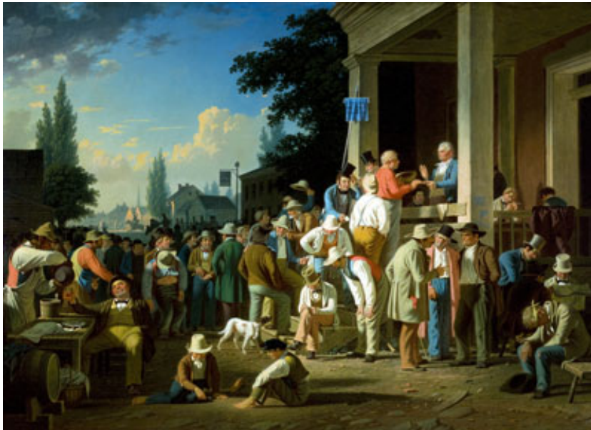
Fig. 1. County Election , Charles Caleb Bingham, oil on canvas, 32 x 52 in. (1852).

sense and continuity to the texture of civic life, Americans, Tocqueville says, are always "on the point of departure." The "love of well-being" that has become the "national, dominant taste" means they are always chasing more wealth and pleasure and "always in a hurry"; "[grasping] at everything but [embracing] nothing," they have no time for stable attachments and, in any case, a population which "itself changes from day to day" comes to "love change for its own sake." So when Tocqueville writes that only newspapers can get large numbers of American to act in common "regularly and conveniently," he suggests that what Americans have in common is the "constant need for novelty" that the daily news delivers and that the news satisfies this need in the shortest amount of time. After all, he writes, "nothing is less suited to meditation than the circumstances of a democratic society," and newspapers are what Thoreau calls "easy reading" or "little reading": they yield up their content to a commercial people whose "habitual inattention" (Tocqueville's phrase)—whose habit, that is, for being unhabituated to reflection—was more conducive to consuming or digesting than to thinking.