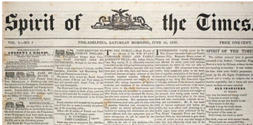
Fig. 2. Detail from front page of Spirit of the Times newspaper, Saturday morning, June 16, 1838, Philadelphia, Pennsylvania.

readers might find five to 20 items in a four-page paper—mostly foreign correspondence, editorials, and political essays, many running for more than a page and continuing from one issue to the next—in 1850, a four-page paper