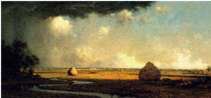
Fig. 7. Marshfield Meadows, Massachusetts, Martin Johnson Heade, oil on canvas, 17 7/8 x 36 1/4 in., (1866-1876).

graffiti is wiped clean. The picture is almost the same, but there is less urgency this time and the closer newsboy has swung his leg around to the front of the post to sit more stably. He wears a regular street cap instead of a Greek cap. In the first version, the window looks into a void, but, much larger now, it is also brighter, flat and emphatically barred in a way that defies the illusion of deep space. As we look forward into a painting that seems to have lost its faith in picturing the news, our "window on the world" is blocked. The shadow from the first version has now grown longer, as if it were later in the day; the way it hangs over the newsboy is reminiscent of a gallows. A bishop's hat encroaches from the lower right, and while there is still an imminent hat to the left, here it is old hat. The bench behind the post is gone with the extra stack of newspapers, which is to say that there are no "extras" in the version of the picture that admits its untimeliness and irrelevance and speaks more to repetition, variation and return. For Tocqueville, the mind in the age of individualism is "constantly active, but it exerts itself in endlessly varying the consequences of known principles ... rather than in looking for new principles. It dances agilely in place." We might say that Tocqueville discovers about the age what Heade discovers when he returns to his painting: that there is nothing new, only the news.