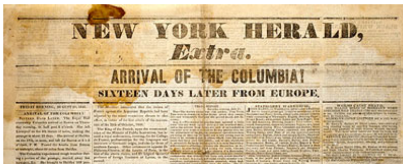
Fig. 4. "Extra Edition," from the New York Herald, Friday morning, August 20, 1841, New York.